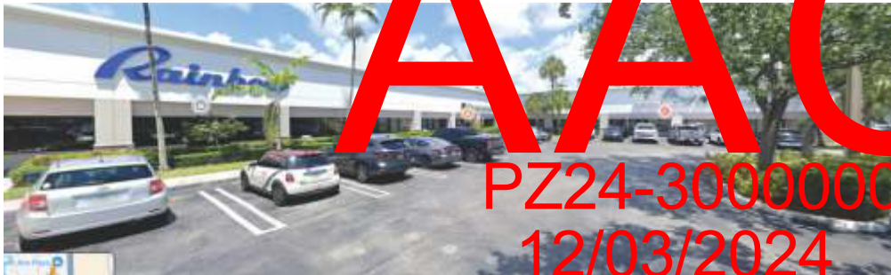
Building 1 EAST Elevation