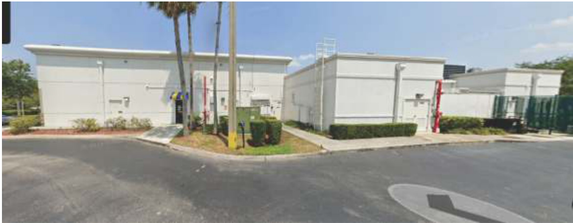
Building 9 West Elevation