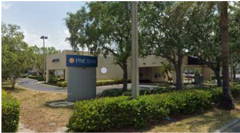
PNC ( Not part of MSP)