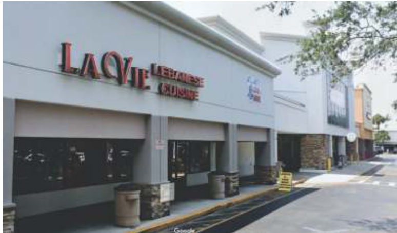
Building 1 East Elevation B