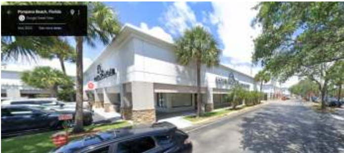
Building 1 East Elevation